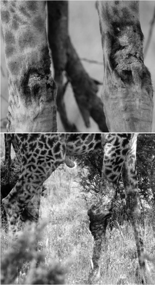
FIGURE 1. Photographs of giraffe skin disease lesions on the posterior forelimbs of adult Masai giraffe ( Giraffa camelopardalis tippelskirchi ) in Tarangire National Park, Tanzania, in 2014. The top is a moderate case; the bottom is a severe case.

absence of GSD within each of the six conservation areas, and prevalence was measured as the number of animals visually determined to be affected, divided by the total number of animals for which the posterior side of the front legs was visible.