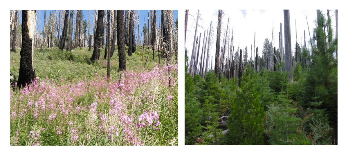
Fire and management effects on CESFs in the Sierra Nevada (photo plates).

Fire is nature's architect in the Sierra Nevada and it varies widely (Figure 2) depending on topography, vegetation, fuels, and climatic factors. Fire regimes most likely to generate CESFs include variable interval and intensity fires in upper montane red fir ( Abies magnifica ); very-long-interval, stand-replacement fires in moist mixed-conifer and white fir ( Abies concolor ) forests; and variable (both short and long interval) standreplacement fires in Douglas-fir and lodgepole pine forests (Chang 1996). Fire therefore is an important pathway to CESFs, whether partially, as in low to moderate fire intensities that create fine-scaled heterogeneity (e.g., canopy gaps where succession is reset) at the stand level, or mixed intensity that creates coarse-grained heterogeneity at the landscape level.