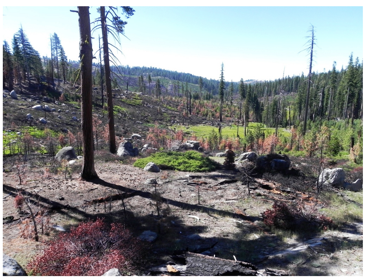
Northwest Yosemite National Park, 2134 m elevation along Tioga road between Crane Flat and Tuolumne Meadows. Mixed-conifer unmanaged forest in the photo includes sugar pine, white fir, incense cedar, Jeffrey pine. Photo taken in 2009, 3 years postfire

CESFs are "ecosystems that occupy potentially forested sites in time and space between a stand-replacement disturbance and re-establishment of a closed forest canopy." (Swanson et al. 2010)