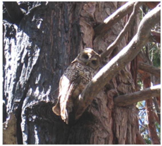
Photo of California spotted owl on snag in the McNally Fire area, California