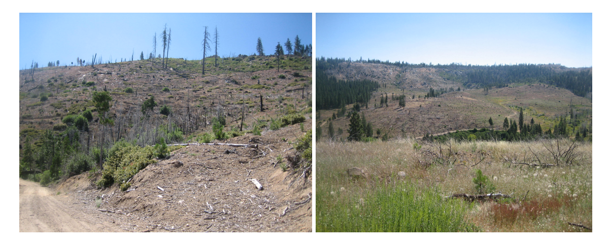
Postfire logged portions of Freds fire in the Eldorado National Forest showing lack of nitrogen-fixing shrubs (left) and presence of Klamath weed (Hypericum perfoliatum) and many readily ignitable, invasive grasses (right) (D. Odion, August 2011).

Although views on fire are gradually shifting, the Forest Service has attempted to mimic the lower severities of mixed-severity fires mechanically or via prescribed fire in mid- to upper-elevation mixed conifer forests. Management aimed at stopping large fires that historically and currently produce landscape heterogeneity continues through widespread mechanical fuel treatments or fire suppression designed to lower the susceptibility of forest ecosystems to high-severity burns. And while there are desired social and cultural