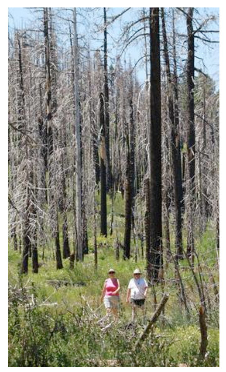
Burned forest, Lake Tahoe area (C. Hanson)

Principle 1 - "Rehabilitation" is not needed in complex early seral forests. Fire acts as a natural restorative agent for these forests by resetting the successional clock and providing habitat for disturbance-dependent species like Black-backed Woodpeckers. Just because they lack live trees initially and are populated by dead trees, does not mean they require site rehabilitation or are "unhealthy" forests. Principle 2 – Limit postfire