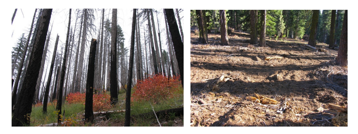
Storrie fire of 2000, S. Cascades, unmanaged with snags and forbs on left and Dinkey post-fire thin on west slope of southern Sierra on the right