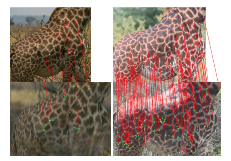
Fig. 1. Visualization of the match between images. Each vertical pair of images is a match identified by Wild-ID. The white points on each show the locations of matching Scale Invariant Feature Transform (SIFT) features identified by the program. Red lines connect these putative matches. The green lines indicate where the features on the lower image 'should' have been located based on the affine transform applied to the upper image. Large green lines indicate nonlinearities in the mapping between the two images not captured by affine transform. High-scoring matches have a high density of red lines and short green lines. The pair of images on the left have few matching features, presumably because the lower image is out of focus, yet this was still sufficient for this match to score highest. The pair on the right is a more typical, high scoring, matching pair.

The software, source code and documentation are available for download by following the Wild-ID link at http://www.dartmouth.edu/~envs/faculty/bolger.html. It is a Java, cross-platform application that runs on recent versions of Windows, Mac OS and Linux.